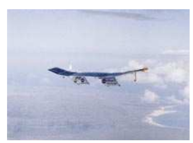
Unmanned solar plane powered by a renewable regenerative fuel cell

The second drawback to the operation of the regenerative fuel cell is the use of grid electricity to produce the hydrogen. In the United States, most electricity comes from burning fossil fuels. The fossil fuel + electricity + hydrogen energy route generates significantly more greenhouse gases than simply burning gasoline in an internal combustion engine. Although the concept of a regenerative fuel cell is attractive, until renewable electricity, e.g. electricity from solar or wind sources, is readily available, this technology will not reduce greenhouse gas emissions.