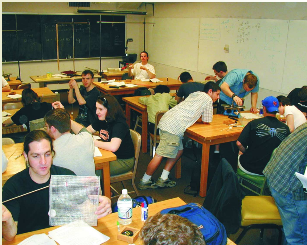
Figure 2. The paradigms classroom. Students are working on a project in the rigid-bodies paradigm to understand the rotational behavior of an asymmetric object. They are constructing such an object by attaching lumps of clay to various locations on a wire cage. When they have finished, quick swiveling of the chairs converts the classroom from lab to lecture. After class, students will reclaim the space as a study area and lounge.

that a single textbook provides. A textbook on classical mechanics, for example, cannot extensively develop the relationships of its fundamental concepts with those of electromagnetism or quantum physics, because the author cannot gauge the depth or breadth of student exposure to other subjects. Our curriculum can develop such connections precisely because we, not the textbook authors, manage the ordering and grouping of topics.