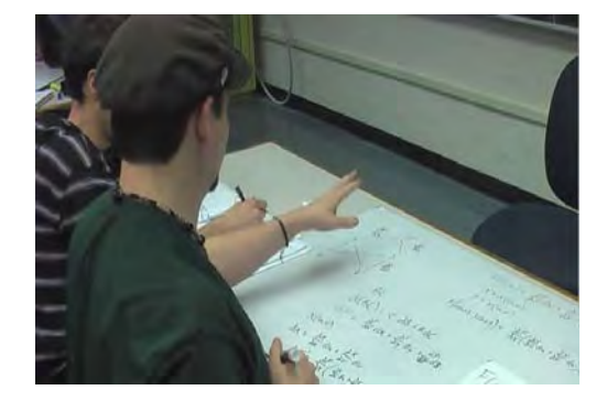
FIGURE 2. Students working with a derivative tree in class.

The different levels in the diagram are particularly helpful to keep track of which variables are held constant in their partial derivatives. OSU students use this representation spontaneously on homework and exams.