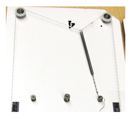
FIG. 2. The system we used in the PDM for for the expert interviews. The system contains a single spring, attached by string to an off-center post. The "observable" strings are routed around two horizontal pulleys towards the front of the machine where they are measured, and are attached to weights.