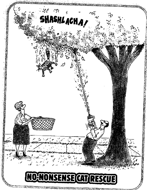
NO-NONSENSE CAT RESCUE