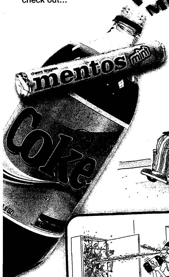
WHEELCHAIR TURBO BOOSTER